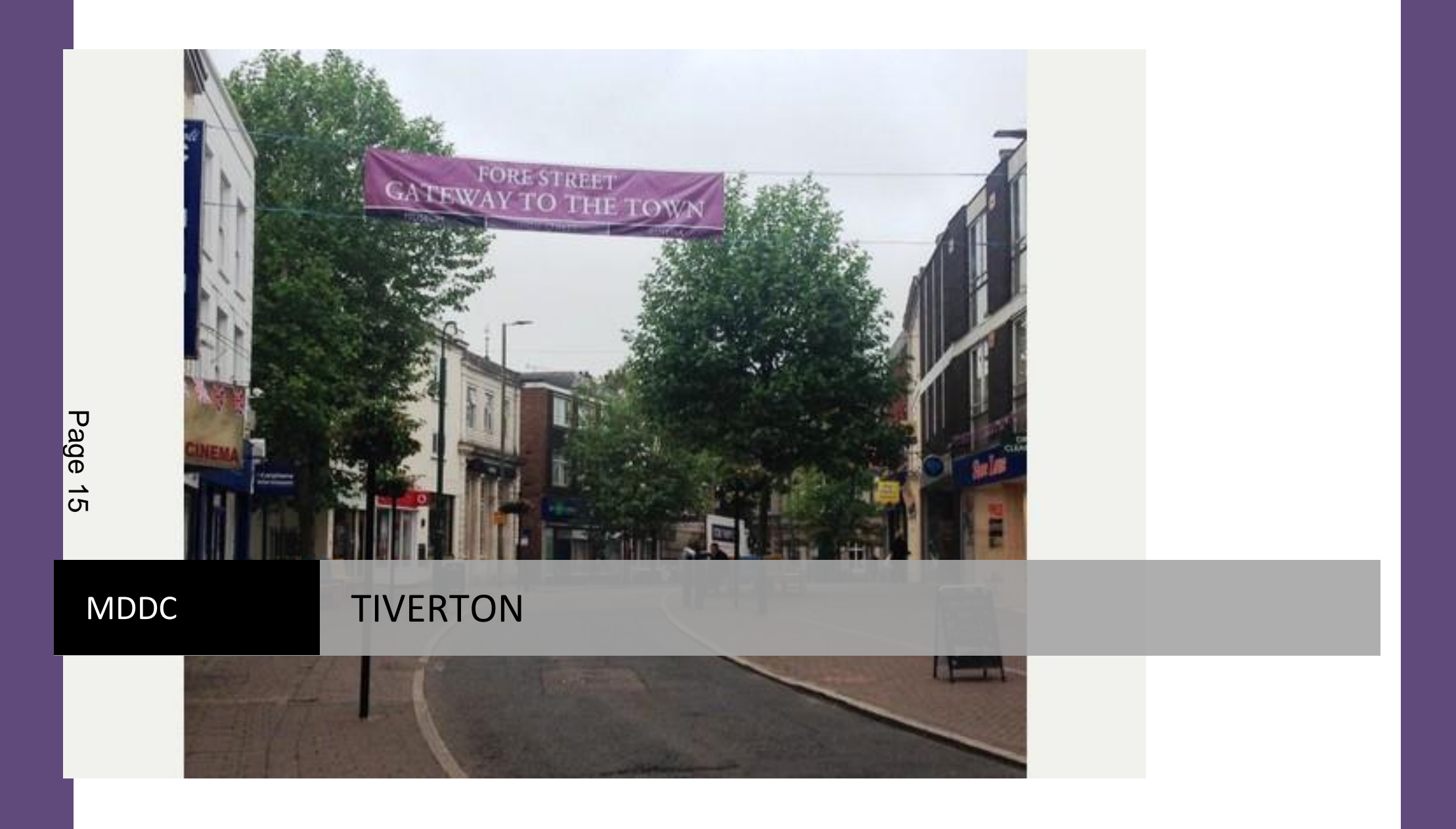
The action plan | Rachel Jenman